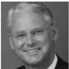
Hon. Gordon Campbell, Premier of British Columbia

The future of infrastructure in our country affects each and every one of us. This conference gives delegates and speakers an opportunity to come to some agreement on where, when and under what conditions the private sector should be partners in making certain we get the infrastructure and services that we need to satisfy our requirements.