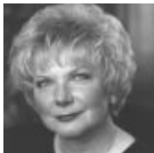
Hon. Patricia Nelson, Minister of Finance, Province of Alberta

To end the day, Global Television news anchor Peter Kent will host the 2003 National Awards of Excellence and help us announce this year's winners.