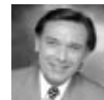
Peter Kent, Global Television News Anchor Hosts the National Awards for Innovation & Excellence in PPP on November 24th.