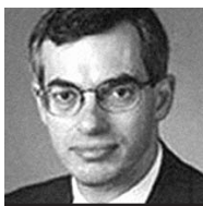
Hon. Tony Clement Minister of Health and Long Term Care, Government of Ontario

The National Awards for Innovation & Excellence Don't miss the announcement of the 2002 Award Winners